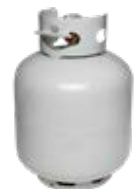
Propane canisters & fuel

* Household batteries include AA, AAA, C, D, 6-volt, 9-volt, camera batteries, nickel cadmium and lithium ion.