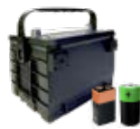
Batteries (household* & automotive)