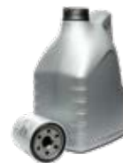
Motor oil & used filters