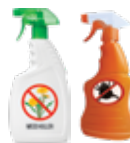
Pesticides, herbicides, fertilizers